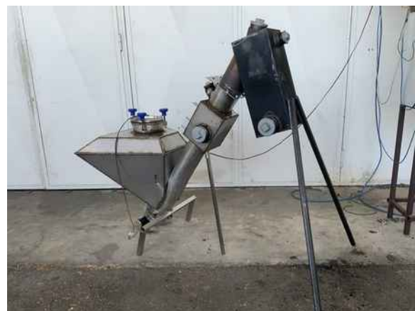
Figure 1: gasifier for solar carbon, thermal power 25 kW.

For our tests we have constructed a very simple gasifier, equipped with an conveyor screw which automatically feeds biomass into the gasification volume, which is the end part of the conveyor tube, just after the conveyor screw. So the design is of extreme simplicity, as for instance the Linear Mirror system itself is of total simplicity.