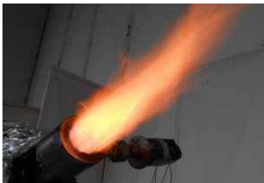
Figure 2: flame from the gasifier

In our test setup, the gas produced by the gasifier is burned in a flame outside of the gasifier, as shown in figure 2. The flame has a temperature of 1200°C, it does not produce visible smoke. According to engineers from the company A2A, the flame would be well suited to substitute the flame from fossil coal combustion in conventional coal power plants [9].